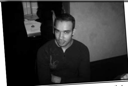
Ronaldo is so stuffed he can't even smile!