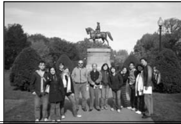
Another stop along the tour through Boston was the Boston Common. Here students pose in front of a statue of Paul Revere.