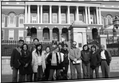
Approach students took a tour around Boston and stopped in front of the State House.