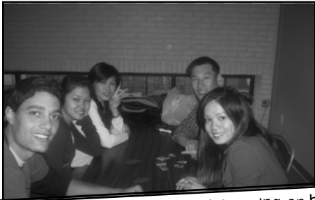
Students at International Lunch learning on how to play a Korean card game called "Go-Stop."